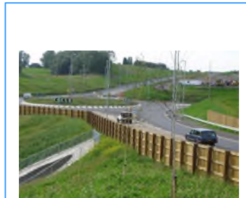
A wood pedestrian fencing on Highway