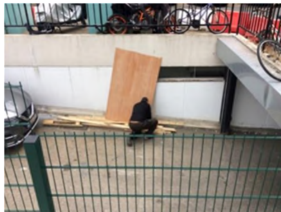
Photo of MoP cutting and collecting wood on live site access ramp.