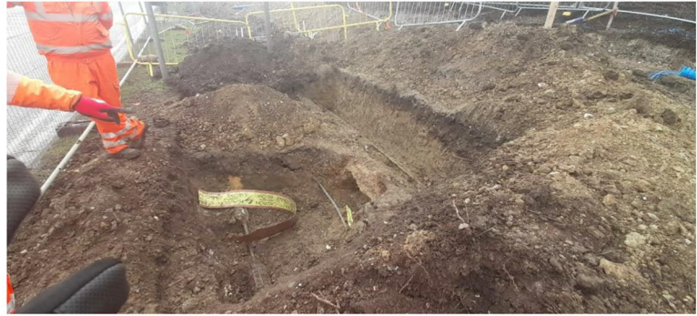
Figure 1 HEI223 Safety Alert

Scott shared that to make a step change in addressing these issues and achieve our zero utilities strike goal, the M25 J10 scheme plan to implement an independent team separate from the delivery where their focus is to: