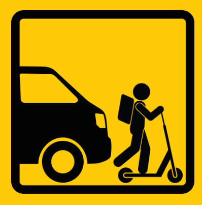
Occupational Road Risk