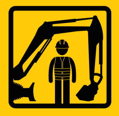
People Plant Interface