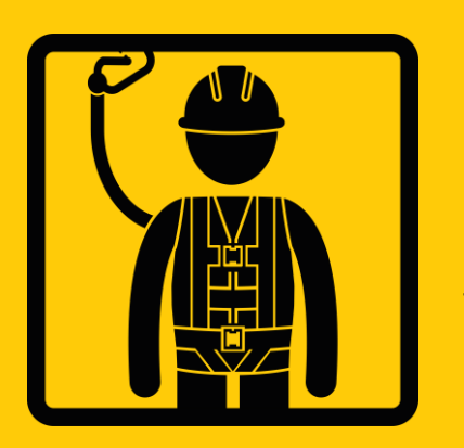
Working at Height