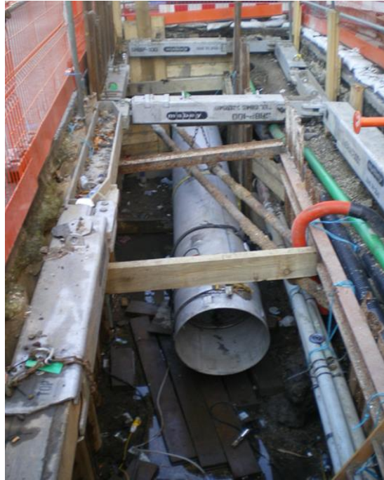
36" diam. trunk main protection works

Emerging Programme Utilities works (c£600m +). UK Programmes: Network Rail, Heathrow , HS2, etc Often Critical Path Commercial challenge on Estimating v Outturn costs Engage late / Tier 1's / Not Strategic Partner Unsighted on Utility's access to our SRN (c2000/yr)