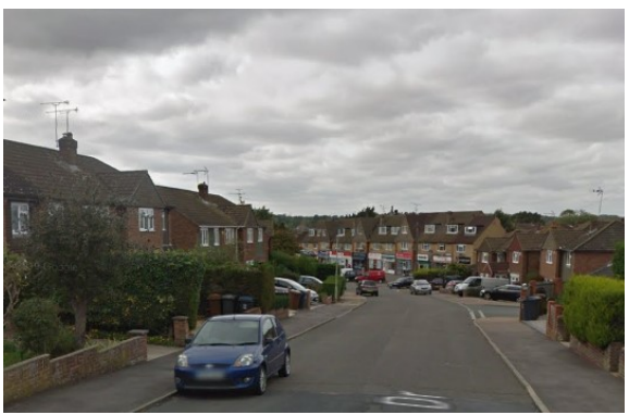
The incident occurred on this typical residential road which was closed for resurfacing work.

At this time only limited details about the incident are available. Incident investigation by the Police and Health & Safety Executive (HSE) is currently ongoing.