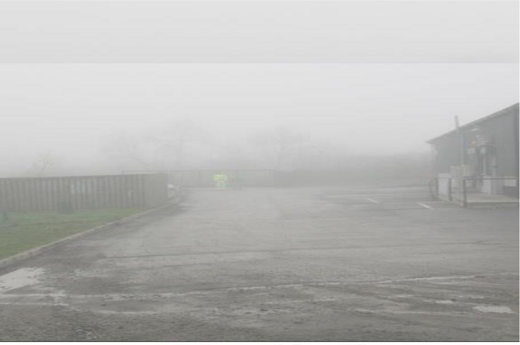
53 Metres (the braking distance for 50mph)