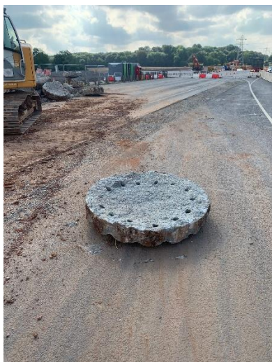
Cropped pile cap