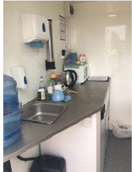
Welfare provision provided for each of the series of 3 Gates through the Stansted estate