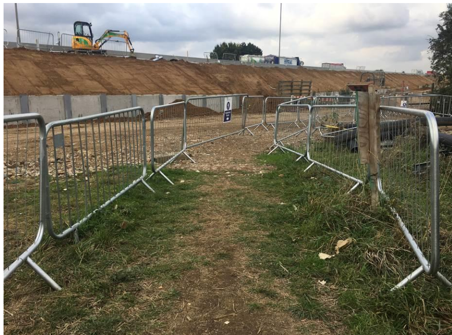
Pedestrian walkways/crossings for the public right of ways