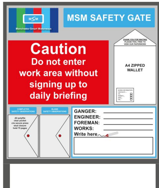
Typical Safety Gate