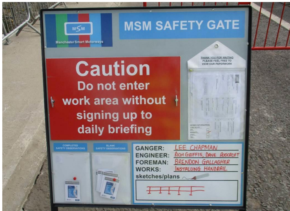
Safety Gate on site