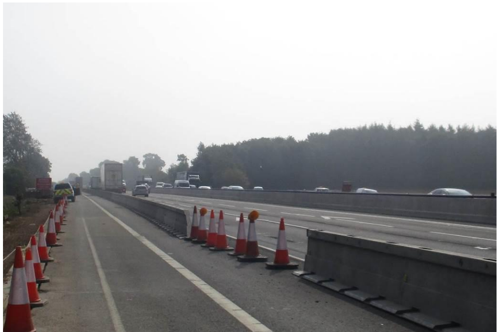
Additional sections of Zoneguard installed to infill access / exit to allow work to take place