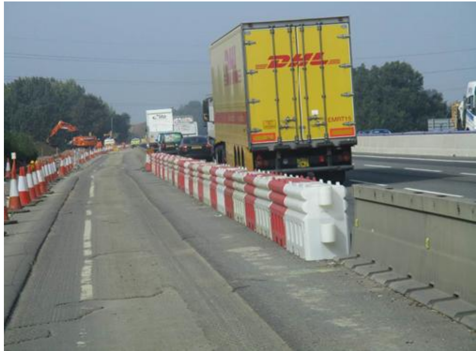
Gap in the Zoneguard filled with water filled barriers (Rhino)