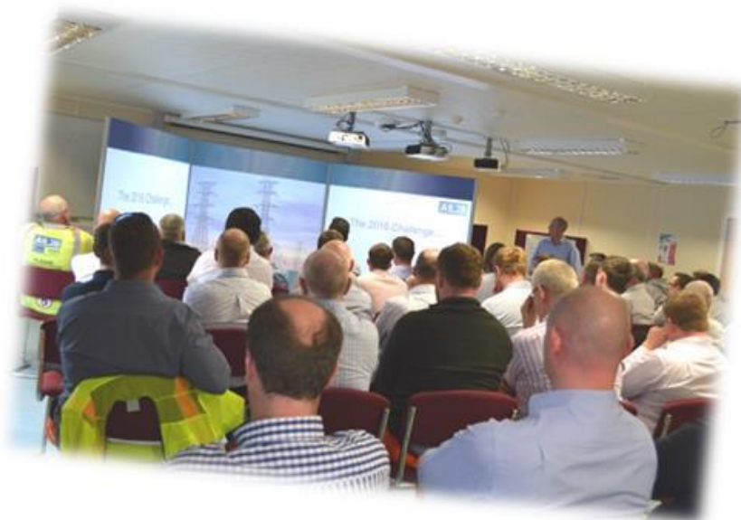
Site Scape 360 technology (Mission Room) in induction room, used for I3R reviews