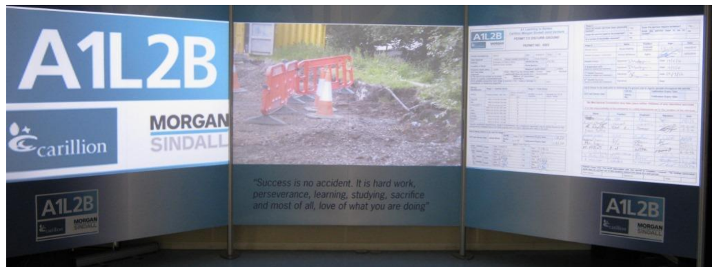
Site Scape 360 technology (Mission Room) in induction room, used for I3R reviews