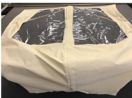
Screen can easily be removed without the use of any tools and disinfected and jet washed off vehicle.