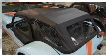
Screen constructed from same material used on soft top sportscars.