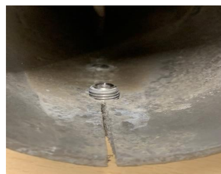
View on Crack / Grub Screws