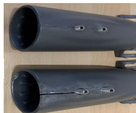
Crack aligned with Grub Screws