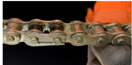
Photo: Correctly installed spring-clip on split-link

The clip is installed above head height and would stop the track bracket from passing below that height.