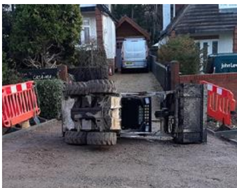
Skid steer on its side