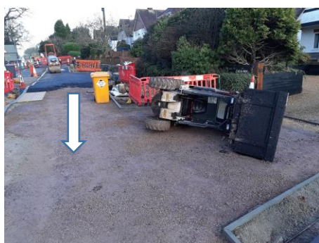
Arrow indicates direction of travel