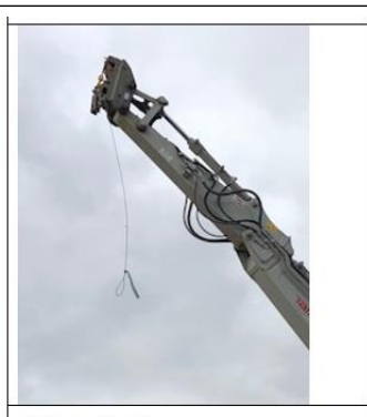
Incorrect Position - accessories crowding the quick hitch