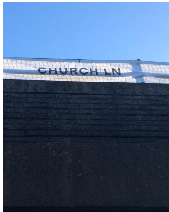
Banner fixed to overbridge