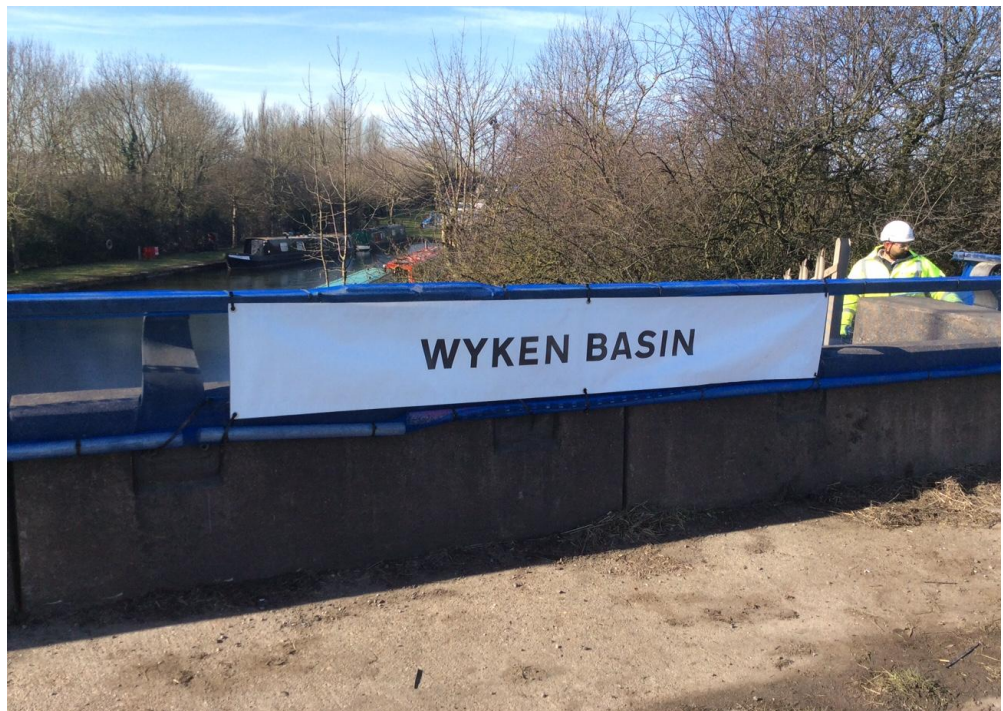
Typical banner located within the works area