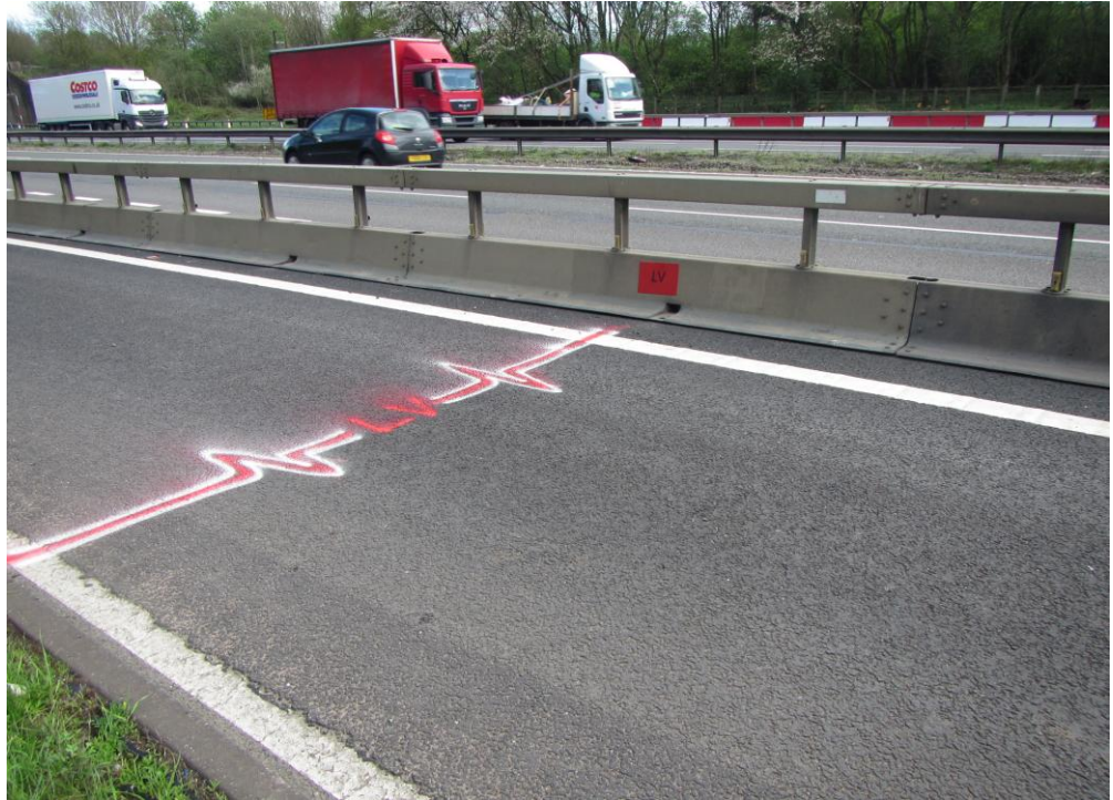
Services marking and magnetic signage on varioguard