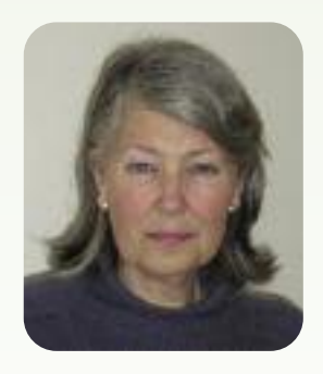
'I have learned to like it'

My blood pressure came down a little. Encouraged by this, I joined a