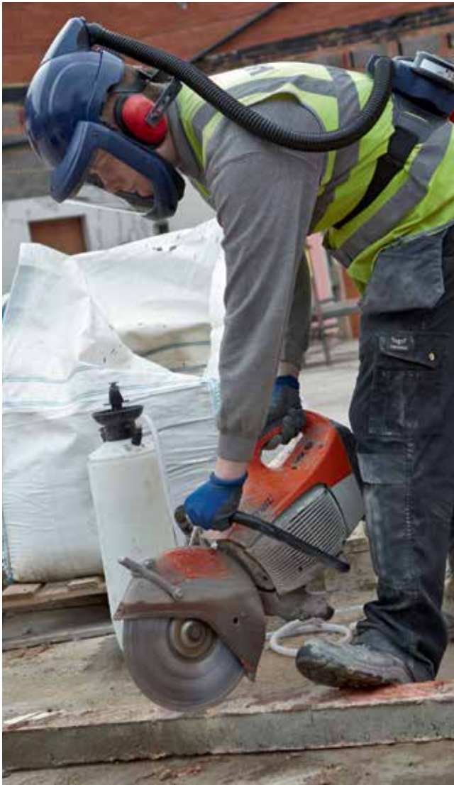
To check for asthmagens, read labels and look at safety data sheets

Formed products for example brick or concrete may not have data sheets and consideration should be given to the type of dust generated from the activity.