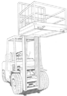
Figure 1 – Counterbalance truck with non-integrated working platform

4. Examples of forklift trucks fitted with platforms are given below:-