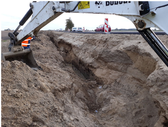
Location of the trench side collapse