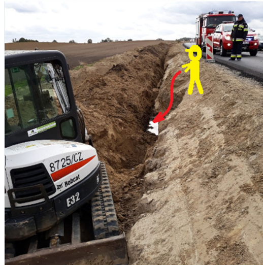
Position of trench collapse where Dominik Rychert was trapped