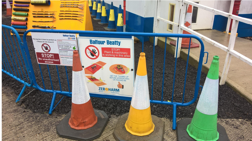
Photo 2: Services board showing cables/ducts being installed on the project. On the reverse side showing cables encountered/ being removed on the project