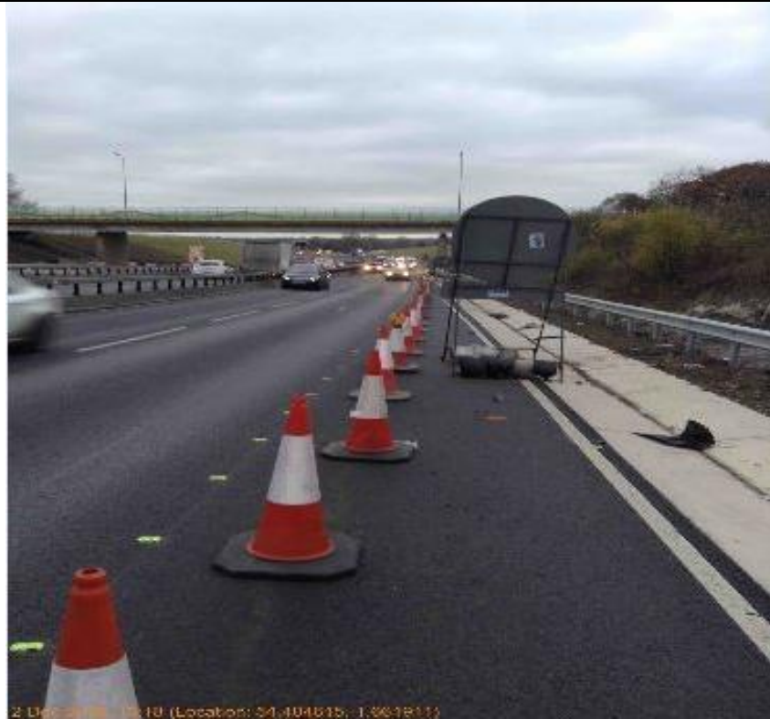
Evidence and time of rectification