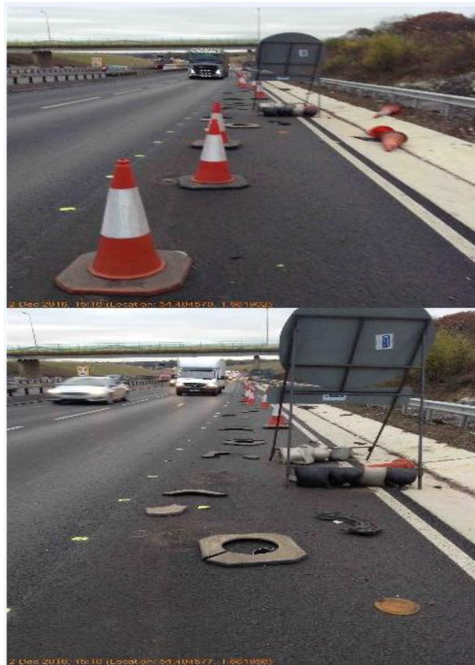
Details of TM damage