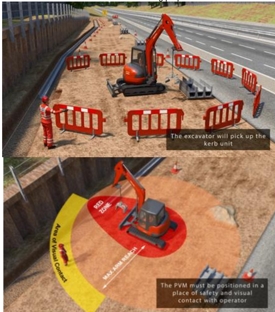
Animated RAMS being prepared