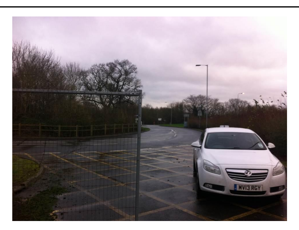
3 - Construction vehicles would exit Roman Lane here and turn right at the roundabout shown and then continue to embankment/compound area via car park as shown on the map on the first page.