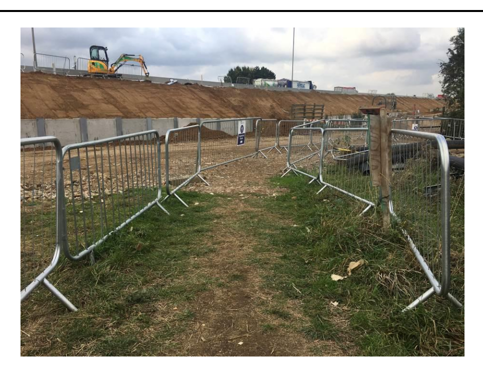
Pedestrian walkways/crossings for the public right of ways