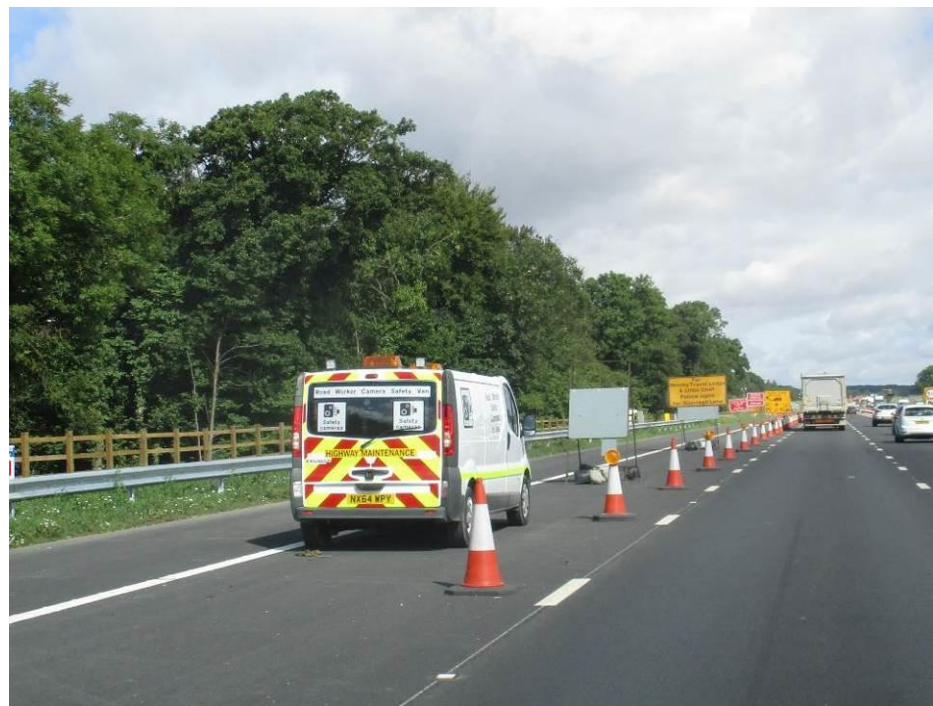
Workforce Safety Camera Van seen at various locations during inspection