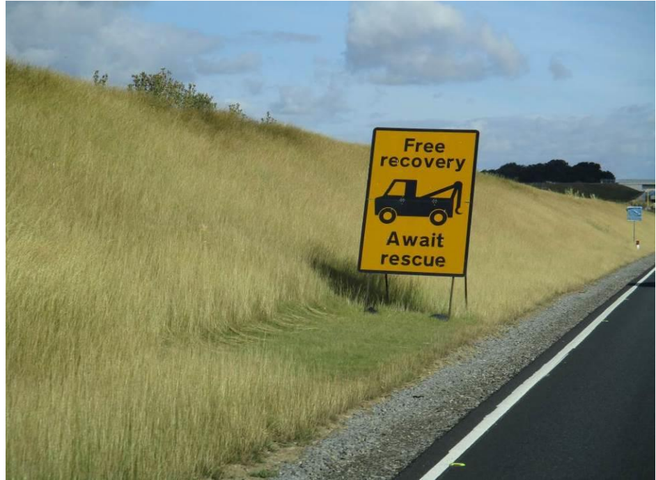
Grass cut in front of temporary signs