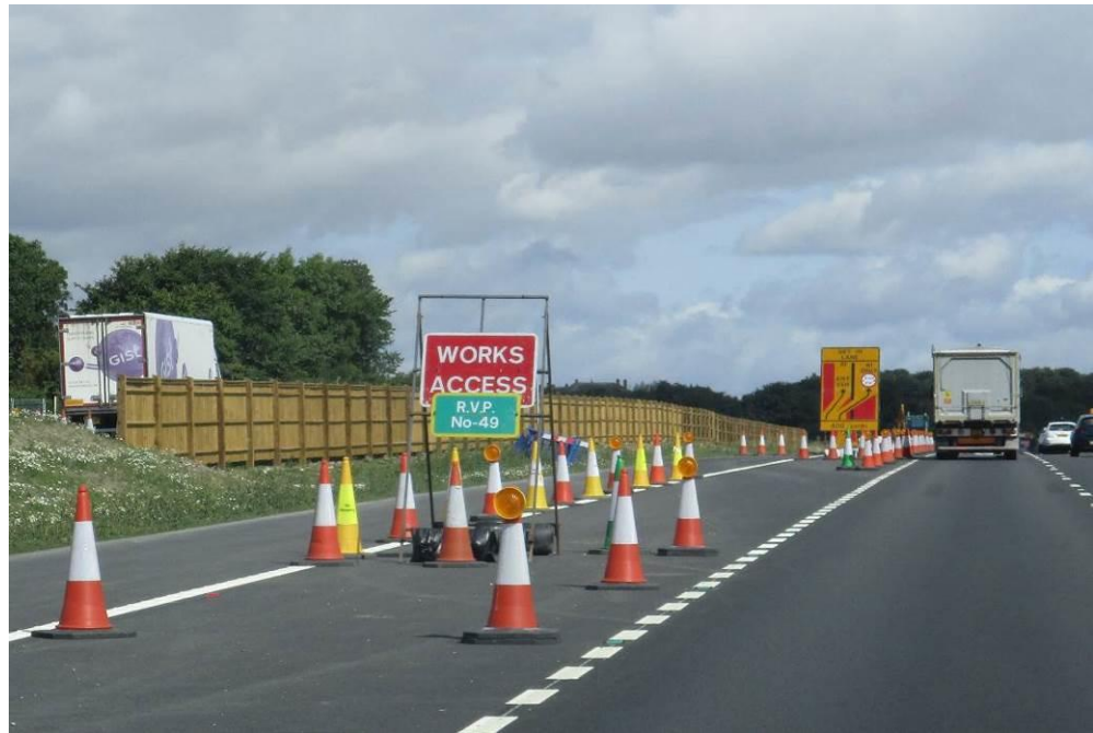
Green and yellow cones at site access points