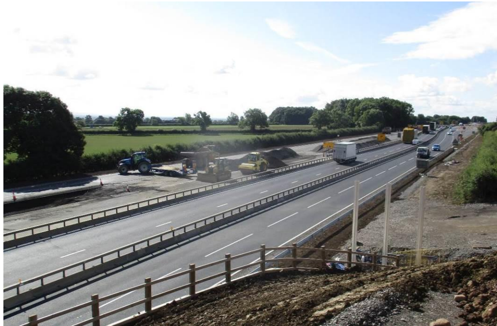
Temporary barriers to protect travelling public, particularly appropriate as the traffic moves from the existing to new carriageway