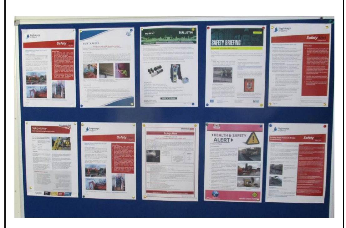
Safety Alerts displayed on noticeboards