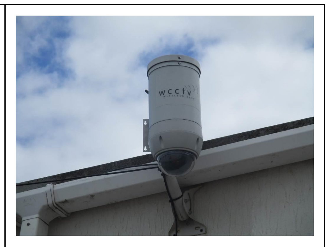
WCCTV camera to be used on plant and at key operations for training purposes