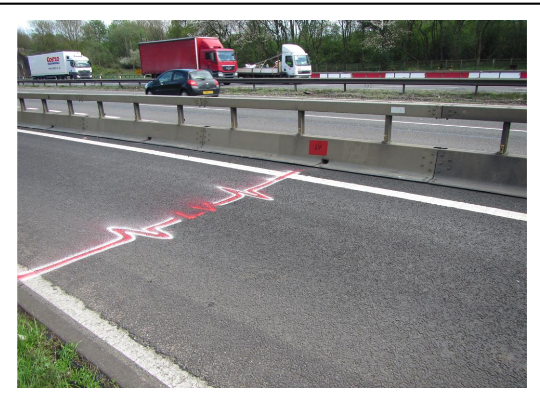
Services marking and magnetic signage on varioguard