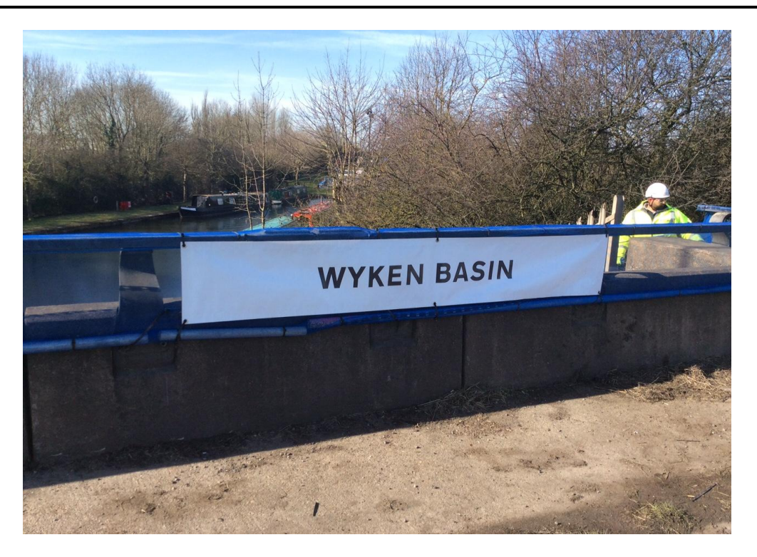
Typical banner located within the works area